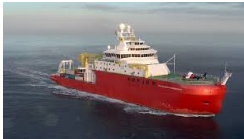
A new polar research ship for Britain