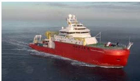
A new polar research ship for Britain